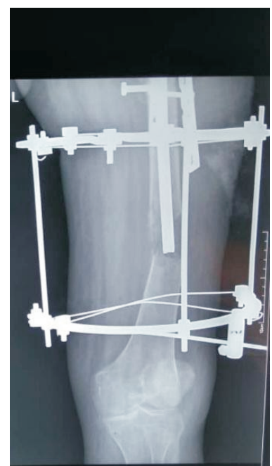
Figure 2c: Ilizarov frame showing regenerate