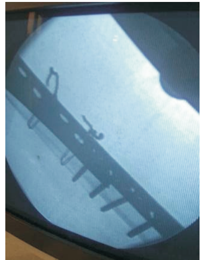
Figure 1c: Distal end of plate and prosthesis of patient 4