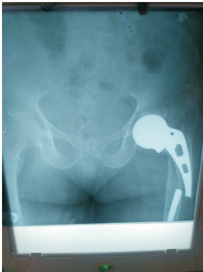
Figure 1a: Pre-op Xray of patient 4