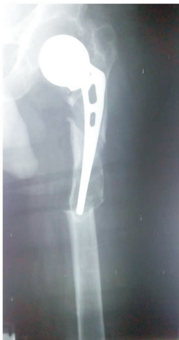
Figure 2a: Pre-op plain radiograph of patient 1