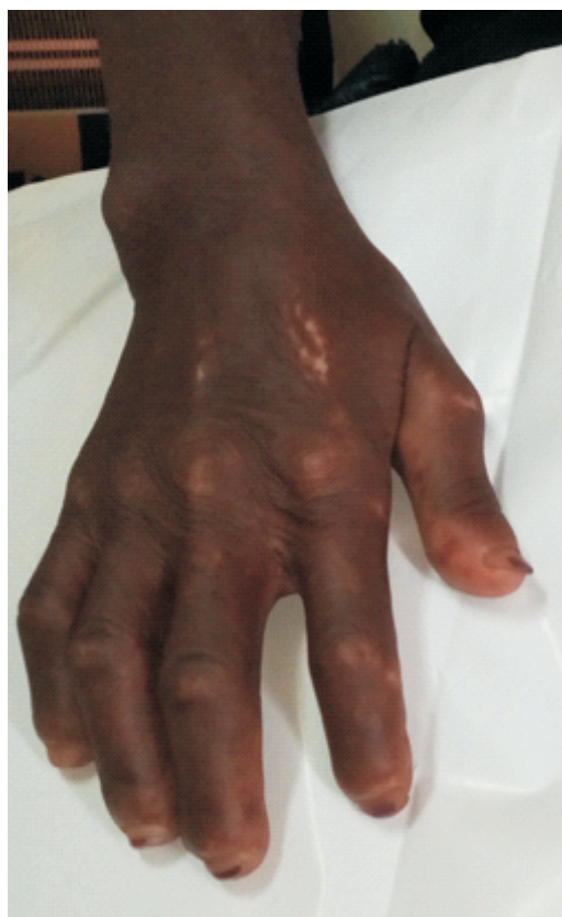
Figure 2. Shows healed pitting ulcers on the finger-tips, with deformed the digits.