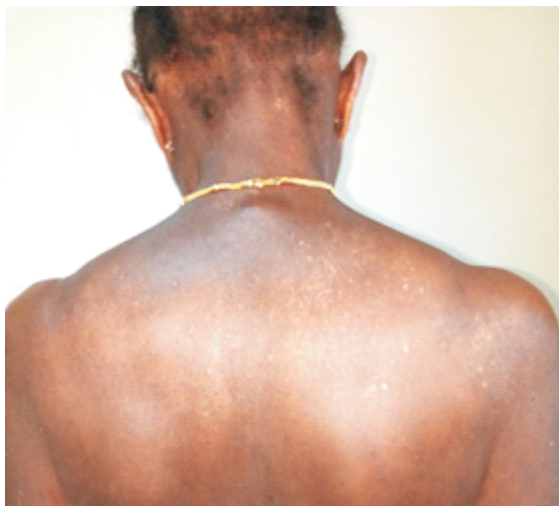
Figure 1. Shows hypo and hyper-pigmented macules on the trunk, in a characteristics 'salt-pepper pattern'.